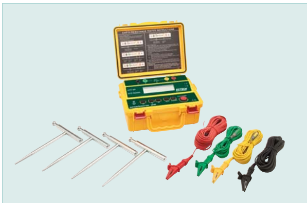
Complete with test leads with alligator clips, 4 auxiliary earth bars, hard carrying case, and eight 1.5V AA batteries