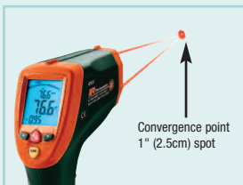
Two laser points converge at a distance of 50"/(127cm) and form a 1" (2.5cm) spot.