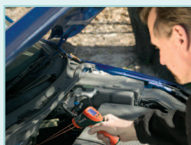
Max hold indicates and holds the peak temperature for easy identification of hot spots