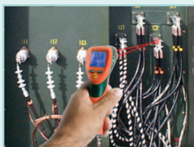
Fast response captures hot spots